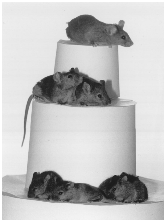
Figure 2. Two generations of cloned mice. The top row is the original cumulus cell donor. The second row is two clones from the above. The third row is four clones of the clones.

We found that embryos developed from enucleated oocytes receiving Sertoli cell and neuron nuclei could develop and implant fairly well, but none de-